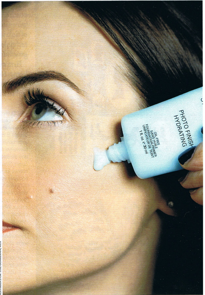
RUIFARIA FOR THE GUARDIAN; REX

But after revisiting them recently, I can tell you they've improved beyond recognition. The new primers actually work. You know those days when your make-up just doesn't go on properly and you have to wash it all off and start again? Primer stops that. You know how foundation creeps off your face in the heat? Not with primer. I don't use it every day - there is, for me, such a thing as a step too many - but if I'm having a bad skin day, or my make-up needs to last until late, it's a lifesaver. Smooth (don't rub or massage) over moisturised skin, leave for a few seconds then apply foundation or tinted moisturiser. Here are my favourite six.