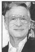
PLAYTIME: Playboy founder Hefner and, right, Lauren Hutton. Jordan loves the look too