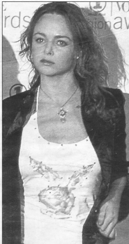
STATEMENT: Stella McCartney in her Chloe version of the T-shirt