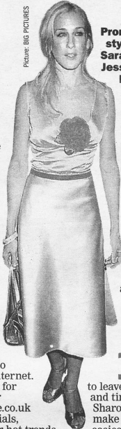
Prom queen style by Sarah Jessica Parker

11 Downsize and smarten-up. Do you really need to carry that battered holdall?